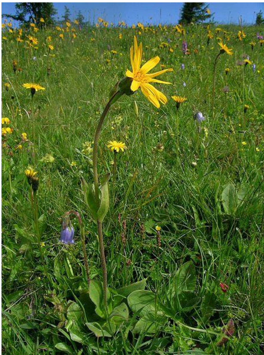
Figure 2 – Arnica montana

Arnica is an ancient medicinal plant. It is also called the „fall weed“ or the „mountain weed“. It is often found as an extract in old tinctures for rubbing into aches and pains, although external application is not usually favourable because it can cause skin irritation. Arnica grows in the mountains, at altitudes between 800 and 1400 m approximately, depending on the climate. I have often seen it there on mountain hikes, but not at lower altitudes.