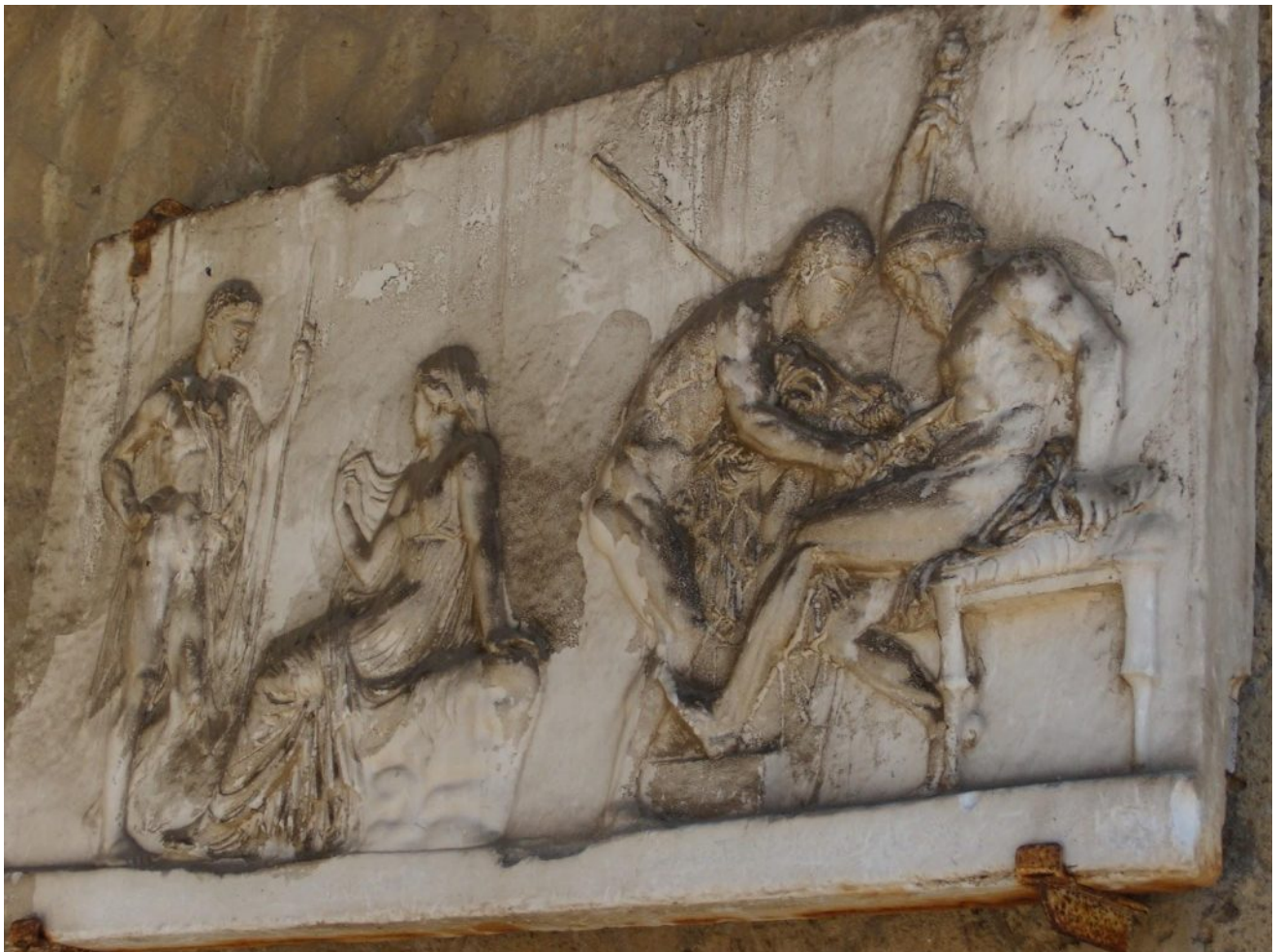
Figure 1 – Odysseus scraping rust from Achilles' spear into the wound of Telephos – relief in Herculaneum.

Homeopathy uses a therapeutic principle that is as old as our culture. Similar things should be cured with similar things, said the founder of homeopathy, Samuel Hahnemann (1755 – 1843). He did not invent this sentence. It is already mentioned in ancient times, e.g. by Hippocrates, the ancient physicians and by Paracelsus. Its origin is the myth of Telephos (Figure 1):