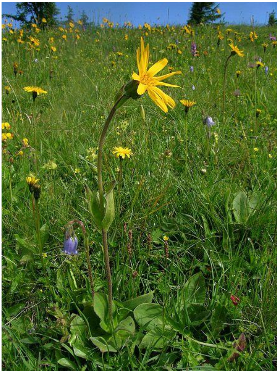
Figure 2 – Arnica montana

Arnica is an ancient medicinal plant. It is also called the „fall weed“ or the „mountain weed“. It is often found as an extract in old tinctures for rubbing into aches and pains, although external application is not usually favourable because it can cause skin irritation. Arnica grows in the mountains, at altitudes between 800 and 1400 m approximately, depending on the climate. I have often seen it there on mountain hikes, but not at lower altitudes.