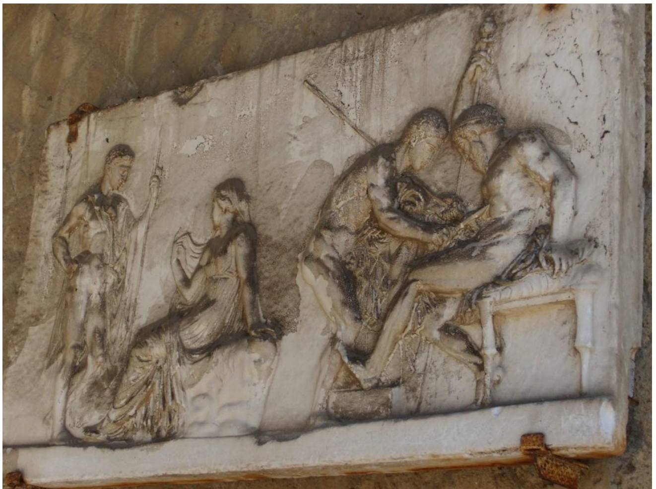
Figure 1 – Odysseus scraping rust from Achilles' spear into the wound of Telephos – relief in Herculaneum.

Homeopathy uses a therapeutic principle that is as old as our culture. Similar things should be cured with similar things, said the founder of homeopathy, Samuel Hahnemann (1755 – 1843). He did not invent this sentence. It is already mentioned in ancient times, e.g. by Hippocrates, the ancient physicians and by Paracelsus. Its origin is the myth of Telephos (Figure 1):