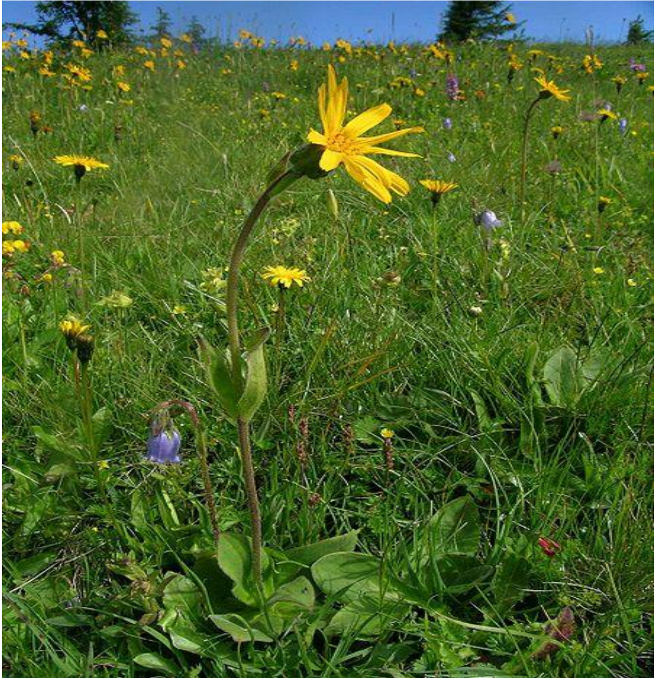
Figure 2 – Arnica montana

Arnica is an ancient medicinal plant. It is also called the „fall weed“ or the „mountain weed“. It is often found as an extract in old tinctures for rubbing into aches and pains, although external application is not usually favourable because it can cause skin irritation. Arnica grows in the mountains, at altitudes between 800 and 1400 m approximately, depending on the climate. I have often seen it there on mountain hikes, but not at lower altitudes.