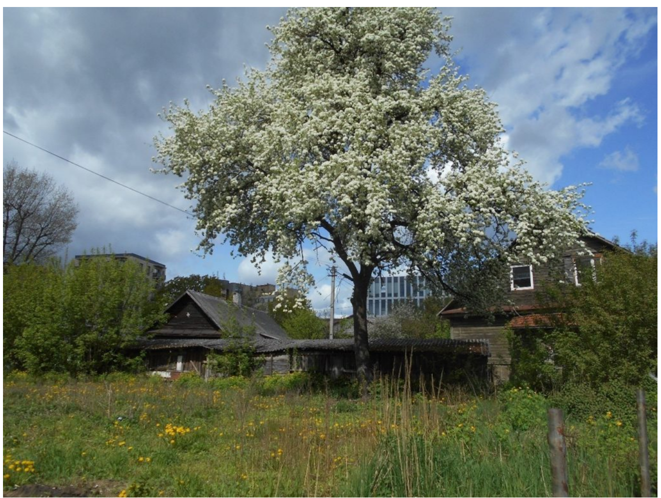
Fig. 5 – Wooden houses not far from the bus stop "Sparta" in Vilnius; in the background a modern building; on the opposite side of the street multi-storey office buildings are under construction

Here I also discovered the first neo-pagan shrine of my life. In the middle of Vilnius, on a square next to an Orthodox church. It was consecrated in 2012, and a light has been burning there ever since. It is apparently modelled on an ancient giant stone in the forest about 40 km from Vilnius, which was probably sacred to the ancient Balts. Rainwater, which collects in it, was considered sacred. Now a small replica has been erected in Vilnius. It is dedicated to a deity called Ragutis, who is supposedly the Lithuanian god of beer. According to the Lithuanian Embassy, he is the god of mead and is one of the four main deities of ancient Lithuania (Figs. 6 - 8).