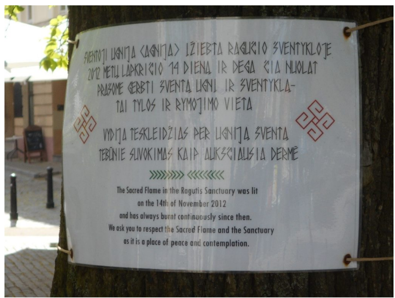
Fig. 7 – The dedication inscription on the lime tree beside the shrine