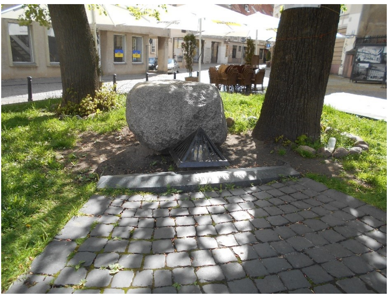
Fig. 6 – The shrine of Ragutis in Vilnius