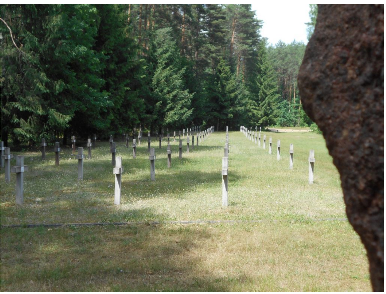
Figure 2 – Cemetery at the Execution Site of the Treblinka Labour Camp

Initially, the forced labourers who died were buried there, later also those arbitrarily executed. In contrast to the cemeteries of the death camp, the identity of many of those buried here is apparently known. The crosses bear names, dates of birth and death. Most of those who died here were 20 or 30 years old, young resistance fighters, members of the Polish army, or those who had fallen foul of the law or had not paid their taxes and were therefore sent to the labour camp. About 2,000 forced labourers were interned there at any one time, a total of about 20,000 over the entire period of the camp's operation. Half of them died of hunger, disease and ill-treatment or were shot for some reason.