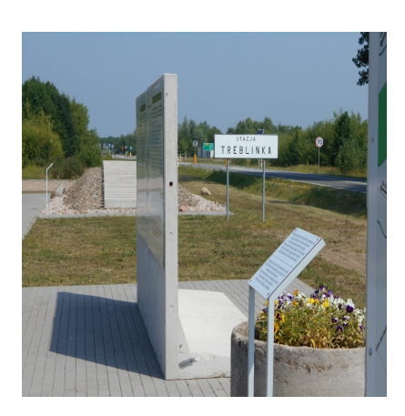
The Long Shadow of Treblinka